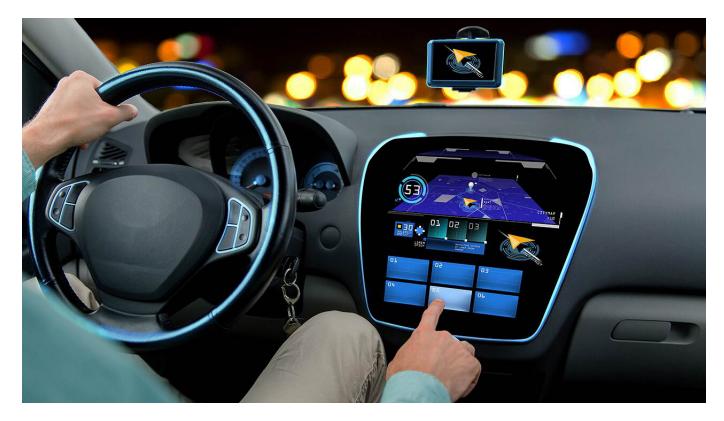
Figure 1. Automotive display with an LCD screen

High resolution and seamless operation are important for larger automotive display screens, shown in Figure 1, as consumers want a clear picture with smooth functionality. Given the harsh environments in vehicles, system reliability and safety are also concerns. As a result, it's a challenge for designers to find a backlight LED solution that's designed for larger screens while also providing a high dimming ratio and ensuring system safety.