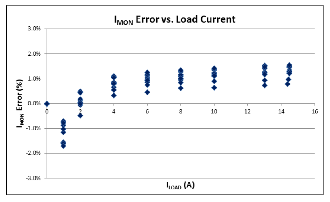
Figure 3. TPS25982 Monitoring Accuracy at Various Currents

Integrating all monitoring circuitry inside the eFuse eliminates the need for large external sense resistors, which saves size and minimizes voltage loss. Since accuracy is so crucial, the TPS25982 analog current monitoring feature I_{MON} has an accuracy of \pm 1\% typical and \pm 3\% maximum across the entire operating current and temperature range. This level of accuracy enables power-management circuitry to receive the most precise information from the servers. Figure 3 shows the accuracy of the I_{MON} feature for different currents.