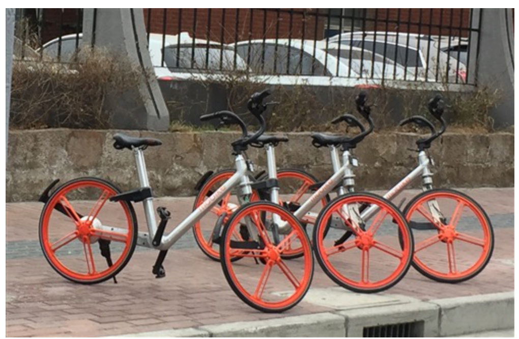
Figure 2. Free Standing Shared Bikes in Shanghai

How does it work? Without a docking station, a shared bike needs a way to be tracked on a network, open the lock and send user data for processing. With a battery-powered electronic lock, Bluetooth ®, GPS and 3G/4G systems, these freestanding bikes are parked securely around the city with an electronic lock, eliminating the docking station. Users find a bike using a map in the phone application and then scan the QR code on the bike to unlock the bike. When they have arrived at their destination, they use the phone application again to engage the electronic bike lock.