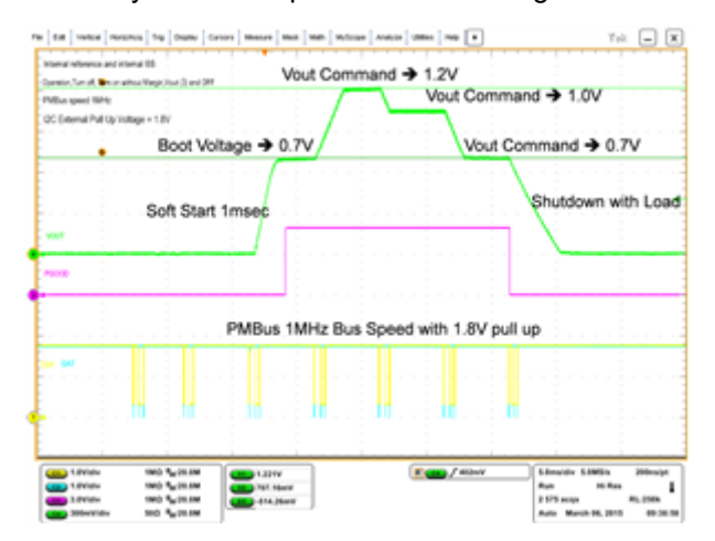
Figure 2. TPS549D22 Digital Events Driven by a 1MHz PMBus Device

Figure 2 shows the waveform of adaptive voltage scaling behavior by using the TPS549D22, a 40A PMBus synchronous step-down converter. A voltage identification digital (VID) chip like the TI LM10011 – with several resistors to support the identical voltage scaling functionalities – is necessary to support the series of digital events shown in Figure 2. The PMBus benefit includes not only BOM cost optimization, but also the printed circuit board area reduction achieved by fewer components and routing traces.