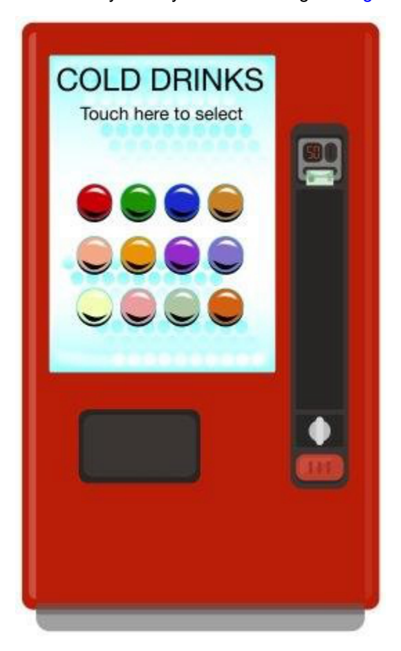
Figure 2. Touch Screen Vending Machine

Studying at a university entails walking about 200-300 miles a day – or at least that's what it feels like. Most students trekking through campus overlook commonplace appliances such as ATMs or vending machines along the path. But there's one vending machine at UT Dallas that catches my eye every time, probably because it has a large touch screen. Haven't seen one? They usually look something like Figure 2.