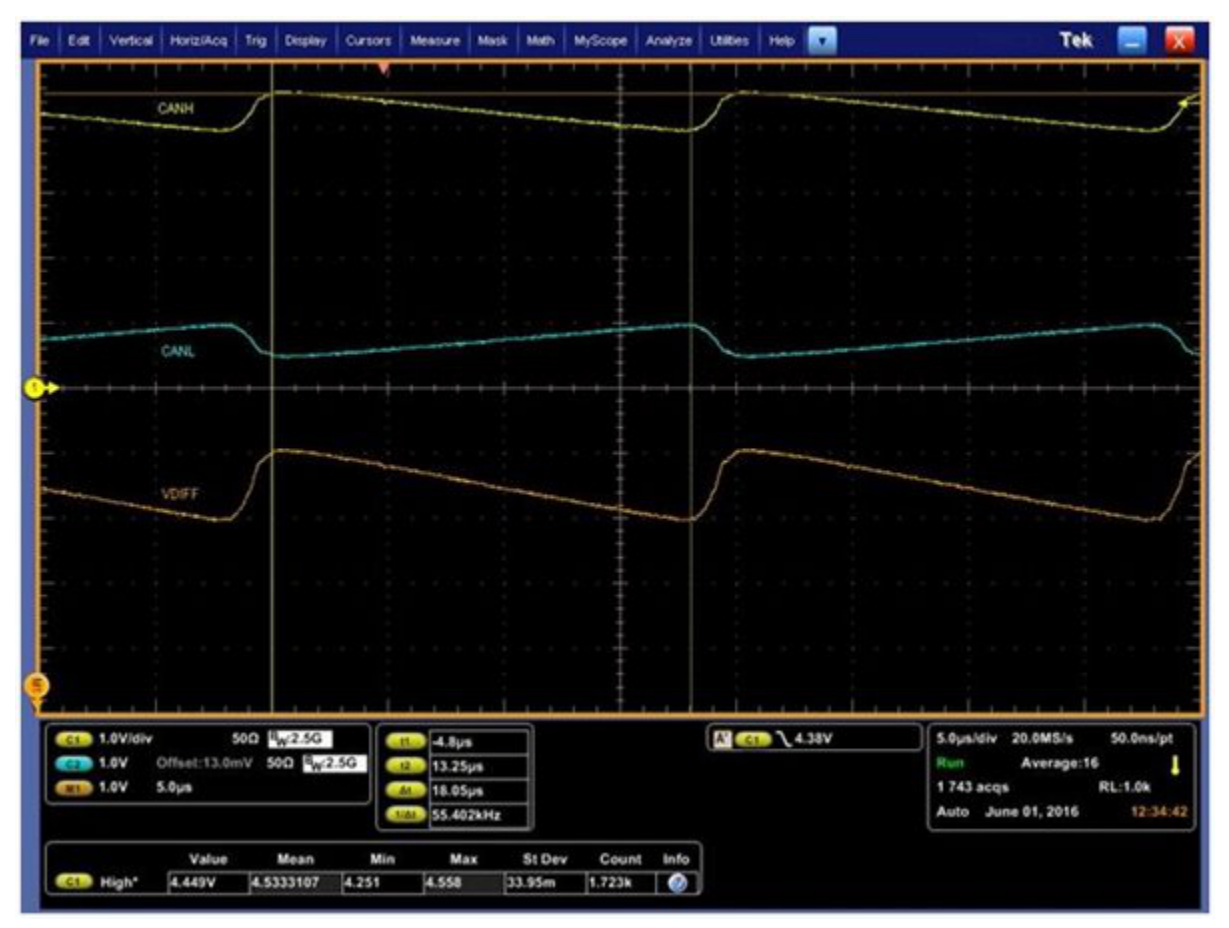
Figure 4. CAN Bus Signals with No Termination (Both Missing)

As you can see when comparing Figure 4 to Figure 3, when you lose one of the two terminations, the recessive edge takes over twice as long to decay (120ns vs. 251ns). This delay will increase with larger and more capacitively loaded networks. For the scenario shown in Figure 4, with no termination resistors the bus will not decay back to the recessive state even after 18.0µs! For cases where the RC delay is too slow, the next bit's sampling point would occur before the bus returns to a differential voltage of less than 500mV and would therefore cause a bit error.