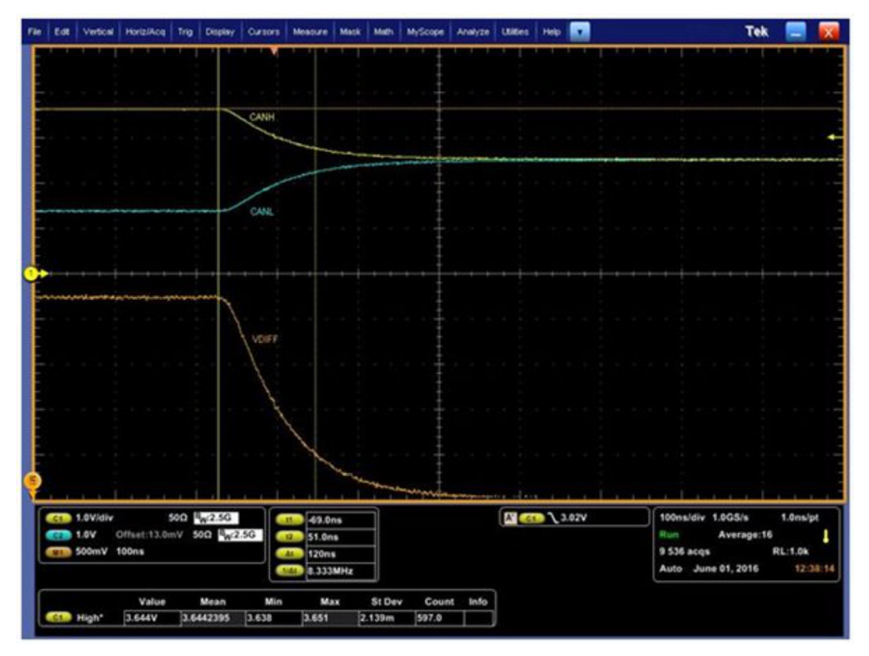
Figure 2. CAN Bus Signals with Two Standard Terminations