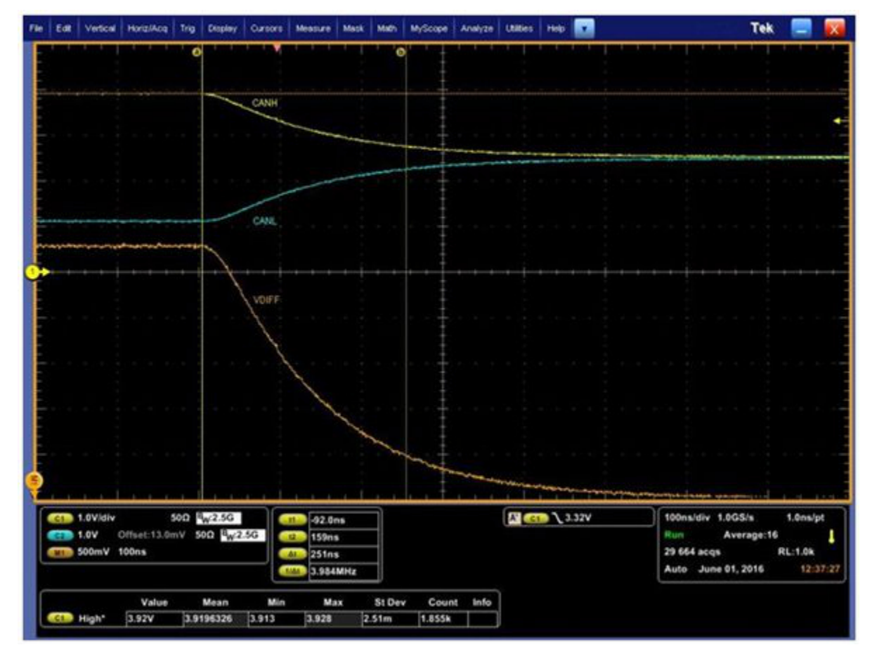
Figure 3. CAN Bus Signals with Only One Standard Termination (and One Missing)