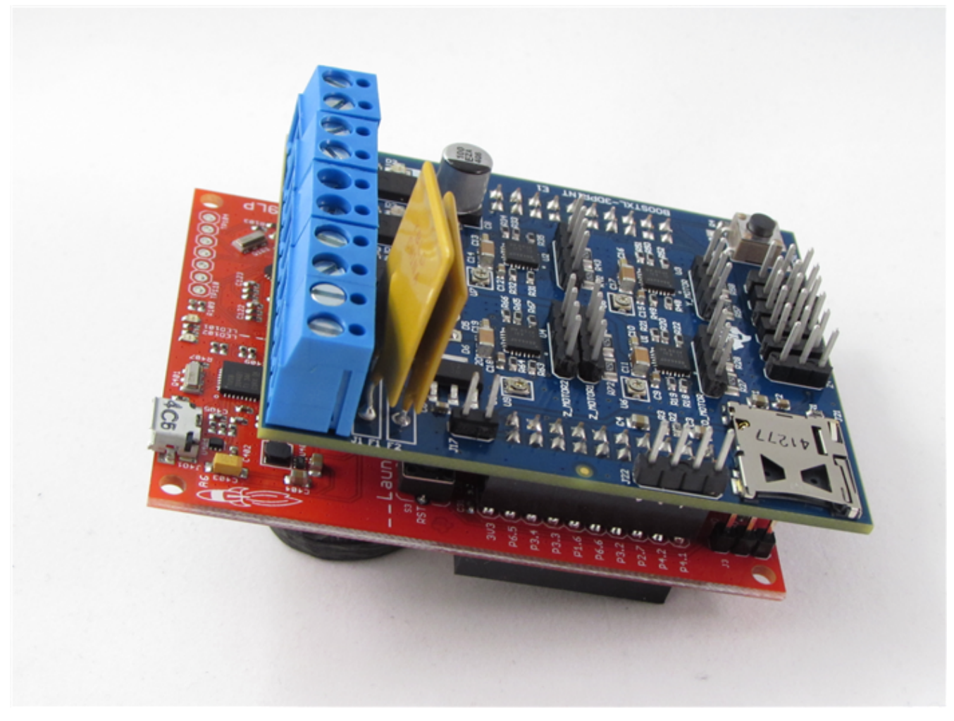
Figure 1. TIDA-00405 Reference Design

In a previous post, I introduced a TI Design reference design for the 3-D printer controller board TIDA-00405 shown in Figure 1 and gave a brief rundown of some of the key TI devices enabling 3-D printers. Today, I'll provide more background about 3-D printing in general. This might be old hat to those who are well-versed in 3-D printers, but may turn on a few light bulbs for those new to working with this device.