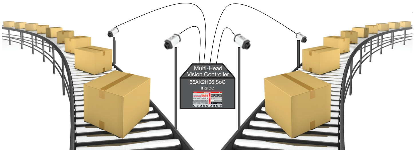
▲ Figure 2 – Example of 66AK2H06 SoC used as the main processor in a multi-head vision controller used to control multiple cameras and run analytics in an industrial automation system

KeyStone II devices feature a network coprocessor AccelerationPac. This AccelerationPac consists of a packet accelerator and a security accelerator that work in tandem to offload the DSP and ARM cores. This enables high-performance network application processing while freeing the C66x DSP and Cortex-A15 processors for other functions like analytics, video encode/decode, running the operating system (OS)