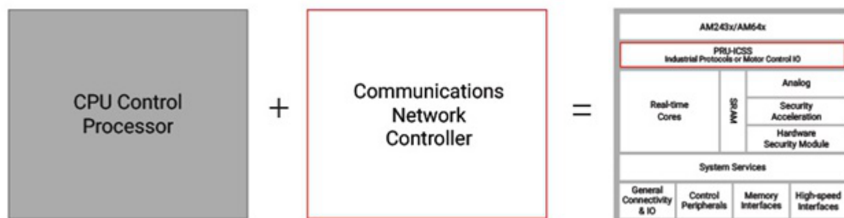
Figure 2. The PRU-ICSS in Both the AM64 MPU and AM243 MCU Families Provides a Single-chip Solution for Real-time Control and Communications

The AM64 MPU and AM243 MCU families of devices are each able to manage industrial communication with a programmable real-time unit industrial communication subsystem (PRU-ICSS), a co-processor subsystem containing PRU cores and Ethernet media access controllers. This structure enables the management of low-level Industrial Ethernet and field-bus protocols through firmware, making AM64 MPU and AM243 MCU application cores available to process – in parallel – both communication and data computation for low-latency, real-time control and communication at the edge.