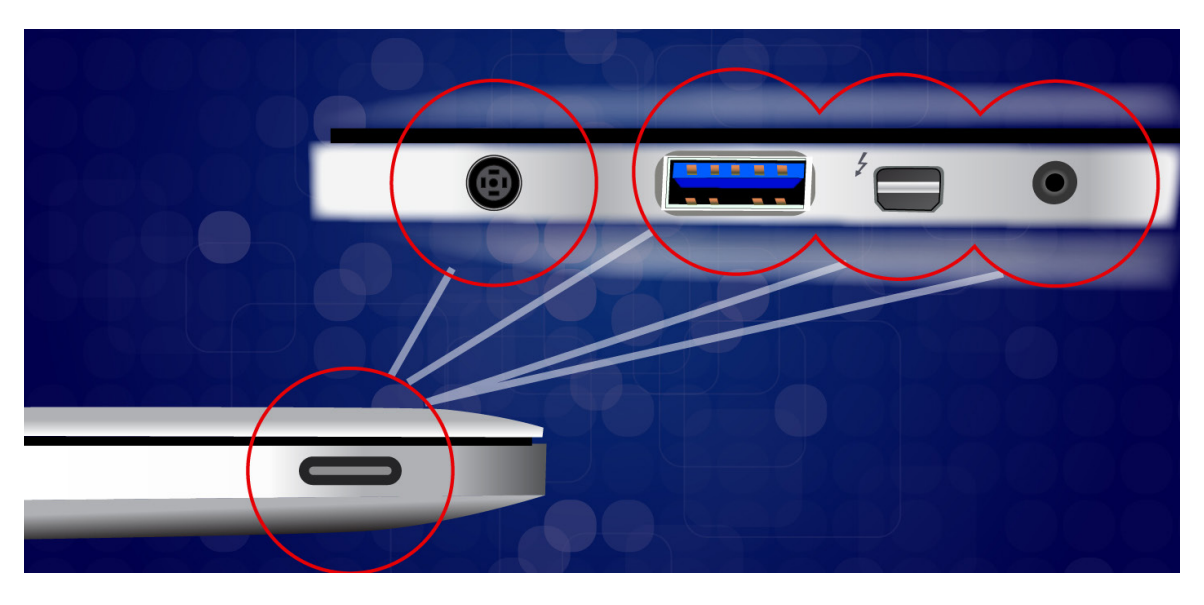
Figure 2. Simplicity of design, enabled by USB Type-C.

USB Type-C brings together all of the desired features of a unified connector, effectively merging data, audio, video and power into one interface. These functions are defined in a way that they can be used in a modular fashion. The interface can be used as a legacy USB-only mode with USB data and default power. The interface can be used with an optional USB Power Delivery (PD) protocol to further enhance power and possibly enable an alternate-mode video.