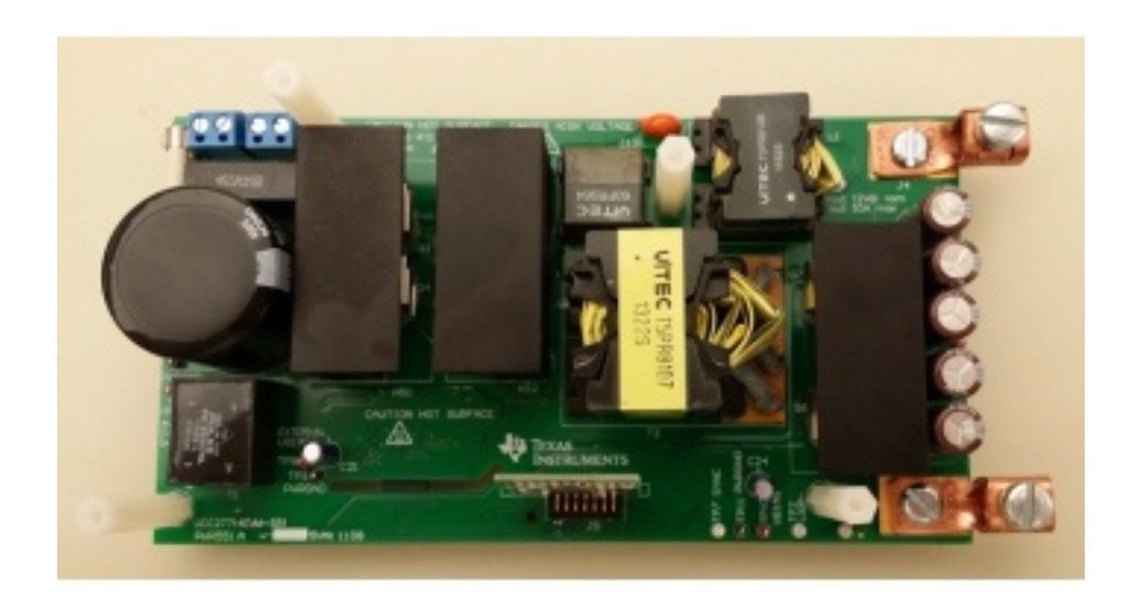
Figure 1. UCC27714 EVM Board

The UCC27714 EVM was designed to demonstrate how the UCC28950 control IC, UCC27524A and UCC27714 gate drivers could be used in a phase-shifted, full-bridge converter. The EVM consists of a power board and a control board. The control board carries a UCC28950 controller for which the UCC28951-Q1 is a pin-to-pin compatible drop-in replacement. Figure 1 is an image of the UCC27714 EVM.