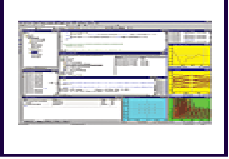
The Developer's Kit demo shows how easily eXpressDSP-compliant algorithms interoperate.

More than 90 TI third-party Algorithm developers have been working with TI's TMS320 DSP Algorithm Standard for more than three years and have developed over 600 algorithms that comply with the standard. These algorithms are designed for ease of integration and to reduce the amount of time spent debugging the system as algorithms are added. Some examples of algorithms available today are video, imaging, voice, speech, hearing, biometrics, telephony, wireless and control. Algorithms are available for all three TI DSP architectures: TMS320C2000<sup>тм</sup>, TMS320C5000<sup>тм</sup>,