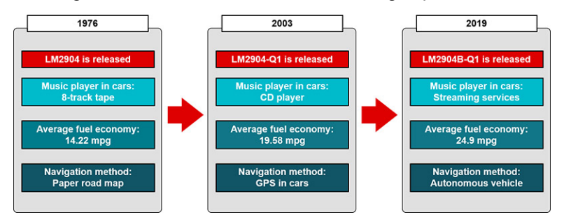
Figure 1. A 43-Year History of the LM2904 Op Amp

Now, after 17 years, the LM2904-Q1 has received a performance boost with the new LM2904B-Q1 automotive op amp, designed to help you meet the evolving needs of today's vehicles. The timeline in Figure 1 includes just a few facts illustrating the changes to both automobiles and the driving experience.