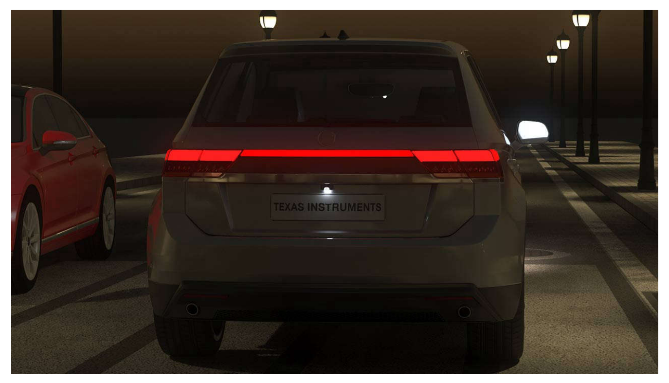
Figure 1-2. Rear lighting that spans across the length of a vehicle

The TPS929120-Q1 includes 12-bit pulse-width modulation (PWM) dimming and offers off-board support – suitable for rear lighting implementations that may span across the entire length of the vehicle, as shown in Figure 1-2. The TPS929120-Q1 can interface with CAN or LIN communication transceivers, as shown in the digital interface LED driving module reference design, for improved communication robustness.