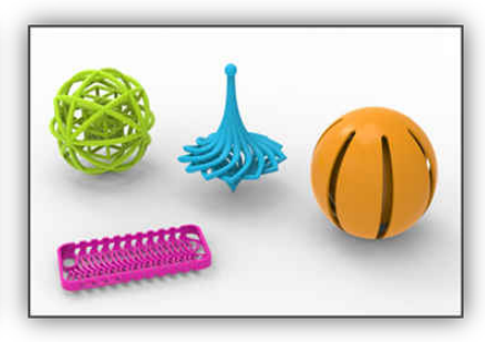
Figure 3. Different possibilities with 3D printing

The new controllers pair with DLP2010, DLP2010NIR, DLP3010 and DLP4710 DMDs ranging in size from 0.2 to 0.47-inches in diagonal and offer a scalable platform. The DLPC347x controllers are pin-to-pin compatible to existing DLPC343x display controllers and offer several additional features that benefit non-display light control applications that include 3D scanning and 3D printing. The controller and DMD mapping is shown in the table below.