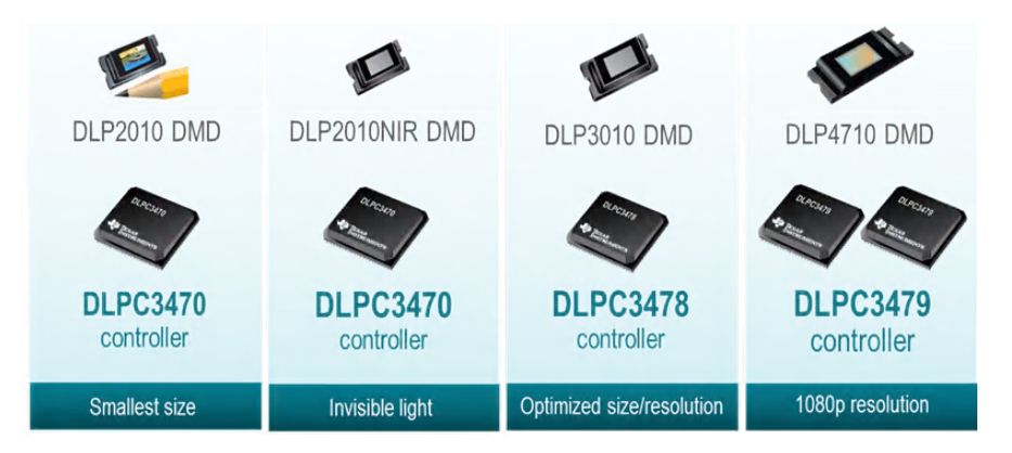
Figure 4. DMD and Controller Mapping

The real world around exists in three dimensions, and human eyes are naturally designed to see the world in 3D. With this new technology, you can now design smart scanning devices that can capture any object in 3D with high accuracy and provide a faithful representation in real-time. It is exciting to imagine the new ways of synthesizing this information and bring novel concepts into real-world tangible 3D objects. DLP technology can help you realize endless possibilities in a broad variety of applications across industrial, medical and consumer markets making our lives more efficient and more fun than ever before.