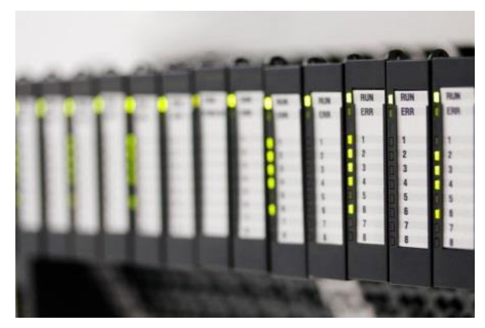
Figure 1. PLC I/O Module Array

Let's have a look on the power requirements and the power design of analog I/O modules.