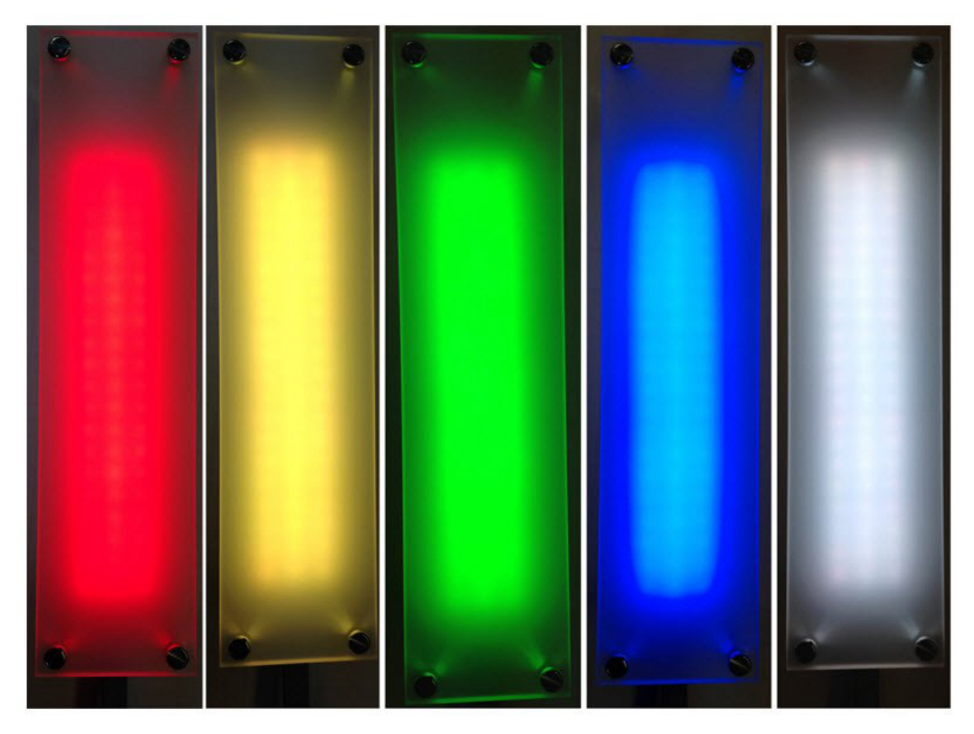
Figure 4. Five LED Segments behind Plexiglas Showing the Main Colors

It is possible to control between one and five LED boards, or even more segments with a higher-power DC/DC converter. With such a flexible approach, you can realize many different styles and colors (Figure 4).