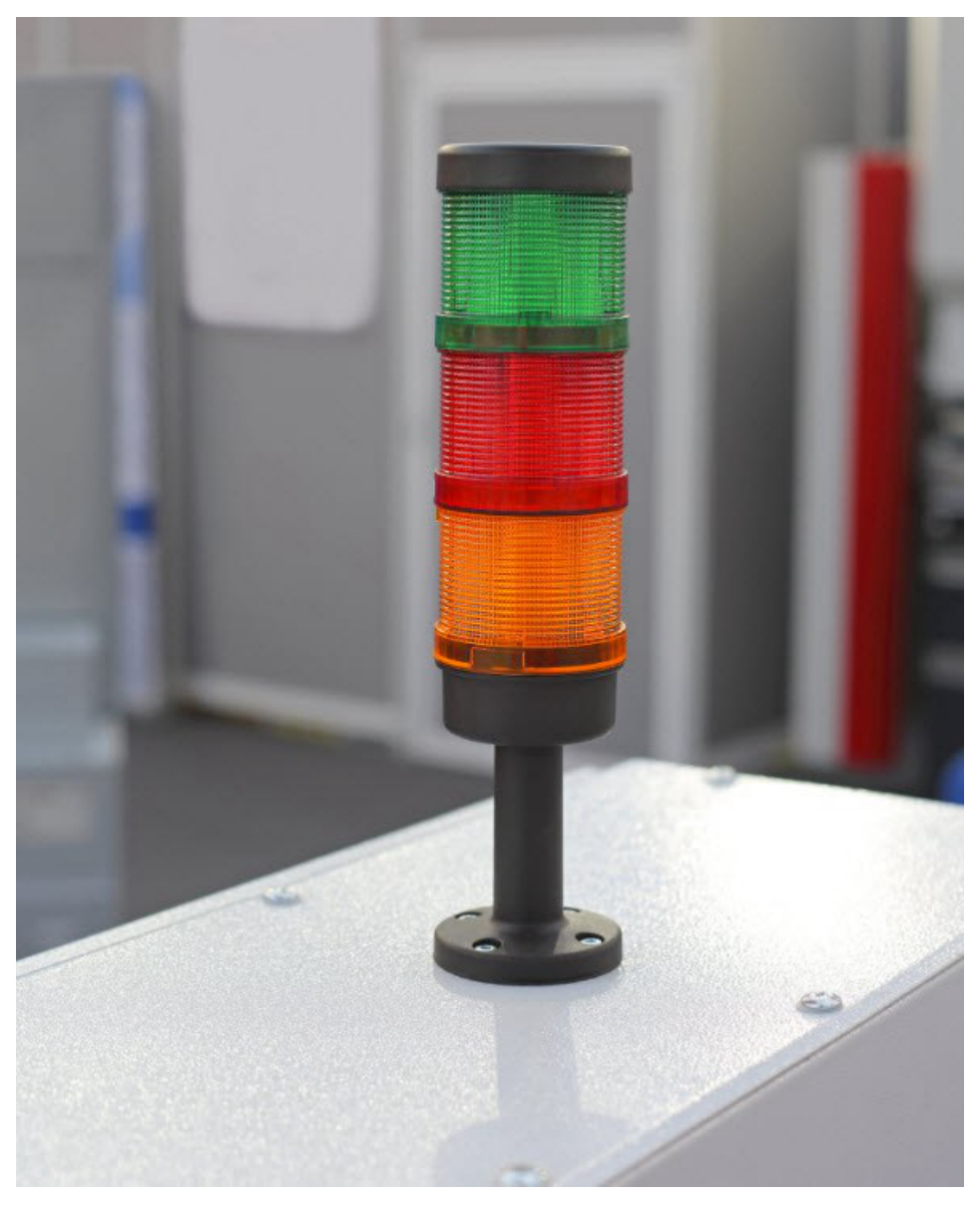
Figure 1. Industrial Stack Light

Traditional stack lights, tower lights or indicator lights in factories used to have a separate lamp for each color (Figure 1). These lamps can be replaced easily with white LEDs with colored casing or red-, amber- or green-colored LEDs with white casing.