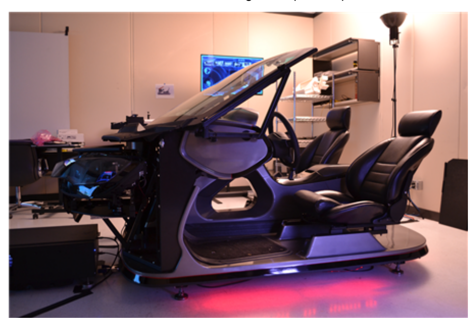
Figure 3. The team constructed the EvoCar last year and continues to demonstrate its unique capabilities

The team was passionate about creating a real world experience that fuses TI technologies with our unique capabilities in automotive displays, driving analytics, smart lighting, and driver awareness. Creating a solution that closely resembles an actual car was critical to creating a complete experience.