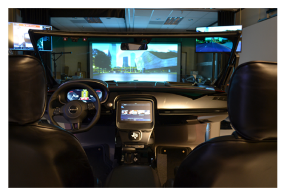
Figure 2. EvoCar combines numerous TI technologies into a single driving experience

The driver HUD is supplemented with a combiner HUD display for the passenger that offers a 12- by 4-degree FOV at a viewing distance of 2.5 meters, showing full motion video to illustrate a unique approach to passenger entertainment – all without distracting the driver. Federal safety standards currently limit the use of motion displays in the front seat, but having the content visible only to the passenger through the head up display eliminates this concern.