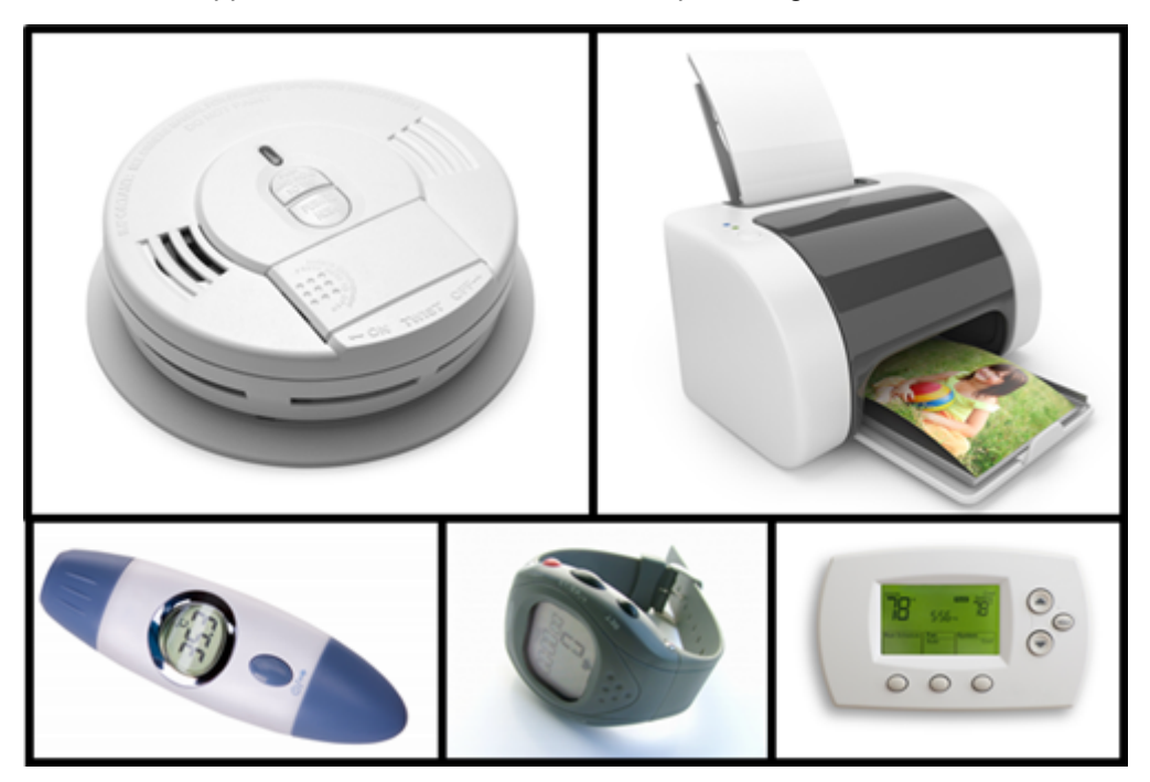
The MSP430FR2311 MCU was designed for sensing and measurement applications

But, if there was an MCU that reduced up to 75 percent of PCB space by minimizing component count in sensing and measurement applications, wouldn't that make compromising almost obsolete?